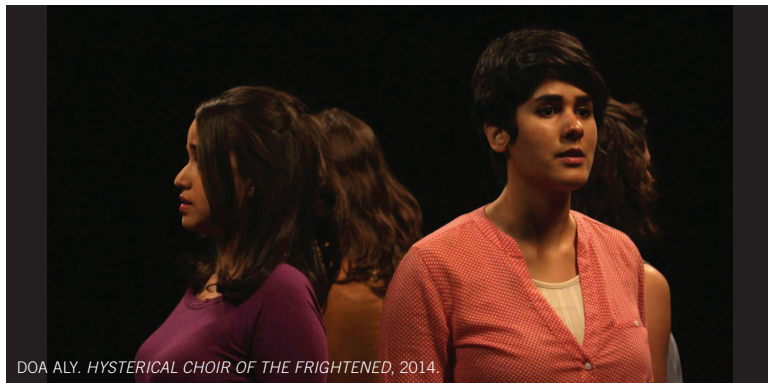
DOA ALY. HYSTERICAL CHOIR OF THE FRIGHTENED, 2014.

Doa Aly (born 1976) attended the Faculty of Fine Arts in Cairo, earning a BFA in painting in 2001. Her work, which spans video, drawing, and performance, has been exhibited at the D-Caf Festival, Warsaw Museum of Modern Art, Eva International Biennial (Limerick City), Huis Marseille Museum of Photography (Amsterdam), the New Museum, Tate Modern, Haus Der Kunst Munich, 7th Busan Biennial, 11th Istanbul Biennial, Stedelijk Museum (Amsterdam) and the International Center for Photography (New York). Doa Aly was shortlisted for the 2017 Abraaj Group Art Prize.