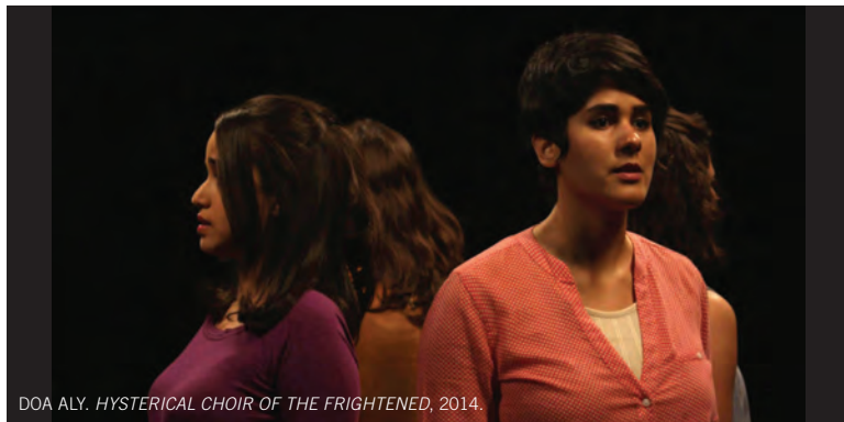
DOA ALY. HYSTERICAL CHOIR OF THE FRIGHTENED, 2014.

Doa Aly (born 1976) attended the Faculty of Fine Arts in Cairo, earning a BFA in painting in 2001. Her work, which spans video, drawing, and performance, has been exhibited at the D-Caf Festival, Warsaw Museum of Modern Art, Eva International Biennial (Limerick City), Huis Marseille Museum of Photography (Amsterdam), the New Museum, Tate Modern, Haus Der Kunst Munich, 7th Busan Biennial, 11th Istanbul Biennial, Stedelijk Museum (Amsterdam) and the International Center for Photography (New York). Doa Aly was shortlisted for the 2017 Abraaj Group Art Prize.